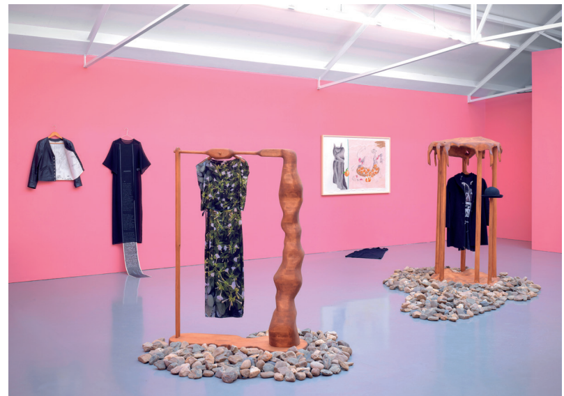
Four Season of Women Tragedy installation view at Galerie Fons Welters, Amsterdam, 2017. Courtesy: the artist and Galerie Fons Welters, Amsterdam.

family, a young military man who worked for an officers' pilot school and his wife. One day, a local cleaner found a cellphone while he was working and opened it, and he saw a picture of the young man biting a woman's hand. This cleaner called the local police. The cannibal family's neighbor told the policeman said that they were a very nice, happy couple, teaching students, ordinary and healthy. That steamed female head in the photo belonged to a woman who had an affair with this cannibal husband. They found each other on Tinder, then he and his wife killed her and cooked her after they had sex.