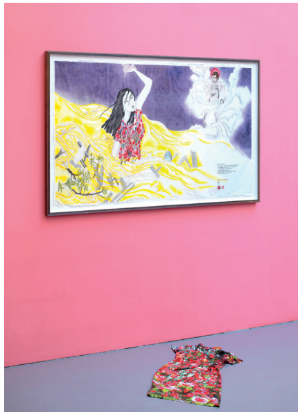
Save my baby first, 2017, Four Season of Women Tragedy installation view at Galerie Fons Welters, Amsterdam, 2017. Courtesy: the artist and Galerie Fons Welters, Amsterdam. Photo: Gert Jan van Rooij

ETW For this body of work, I showed my own dresses and I made big drawings based on short tragic stories told by my female friends. I put the dresses on the ground, close to the drawings, so people will see that the dresses are actually in the drawings. They might want to touch the dress and touch the drawing with their own hand instead of watching them. I think these elements create an environment where our subconscious could swim in