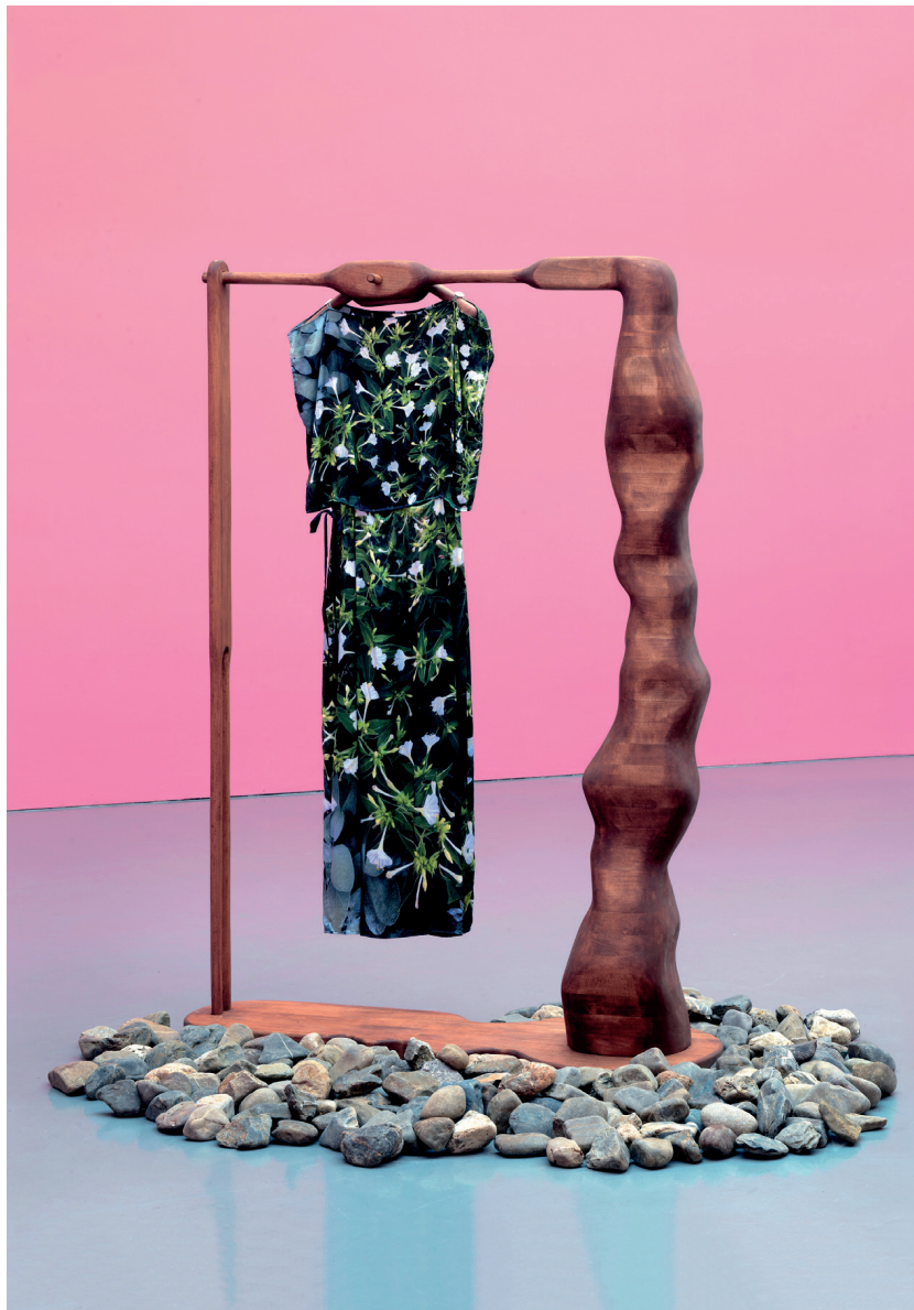
Summer, 2017, Four Season of Women Tragedy installation view at Galerie Fons Welters, Amsterdam, 2017.