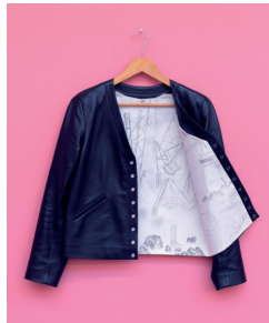
Jogging on Rotterdam Harbour, 2017, Four Season of Women Tragedy installation view at Galerie Fons Welters, Amsterdam, 2017.