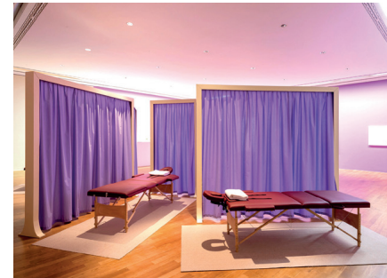
Massage Parlor , 2016, Dorothea von Stetten-Kunstpreis installation view at Kunstmuseum Bonn, 2016.

HF A group of works assembled under the title Massage Parlor (2016) reflects further on your position as a Chinese woman living in a European context. At that time, you were working in a massage parlor in Amsterdam to make a living, but simultaneously exploring the parlor as a site where many paths, desires, and people intersect. Both a deeply personal piece as well as a more general reference to the status of migrant workers in the wellness industry,